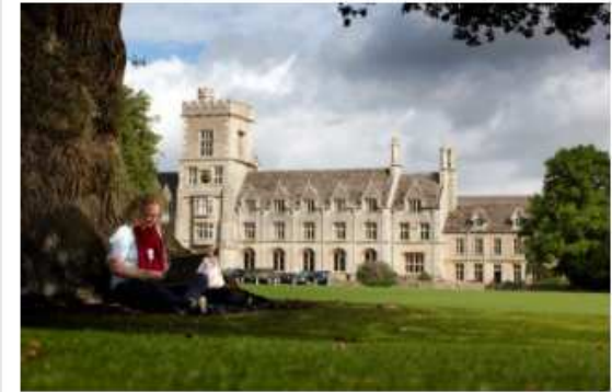
Royal Agricultural University