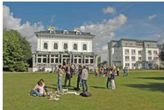
University of Gloucestershire