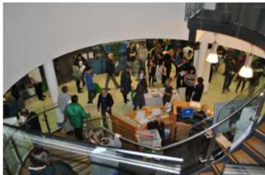
South Gloucestershire and Stroud College