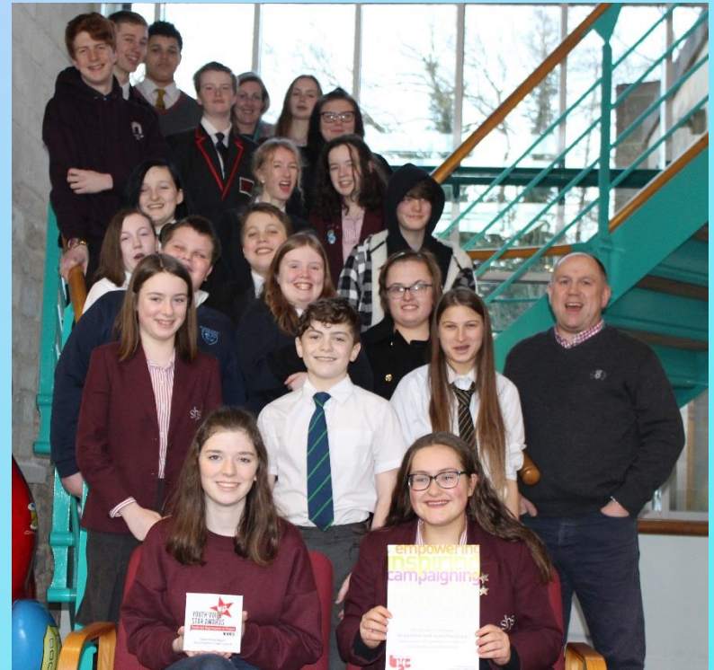
Winners: British Youth Council Youth Voice Award for Youth-Led Organisation of the Year

'Youth Participation is the process by which children and young people influence decision making which brings about change in them, others , their services and their communities '